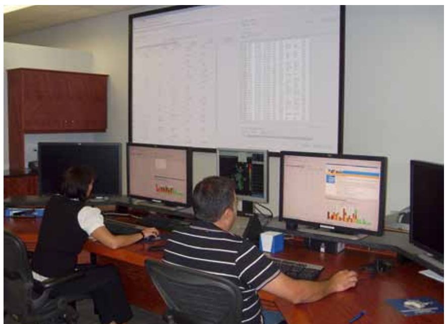
ATNS Traffic Flow Managers utilizing Metron Traffic Flow at CAMU. ATNS is responsible for Air Traffic Management in approximately 10% of the global airspace. Operating at 20 aerodromes within the country, ATNS manages about 685,000 arrival and departure movements per year.

Given the consolidated process provided by the Thales and Metron technology, South African airspace and airport facilities are better able to calculate aircraft trajectories and accommodate the aircraft operator's requirements, and are thus, better equipped to handle the volume of traffic and other circumstances surrounding the world's premier football tournament. ■